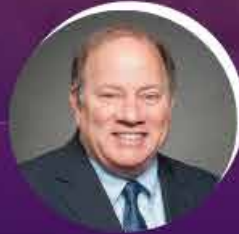
MAYOR MIKE DUGGAN City of Detroit