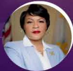
MAYOR LATOYA CANTRELL New Orleans, LA