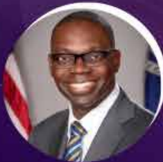
LT. GOV. GARLIN GILCHRIST State of Michigan