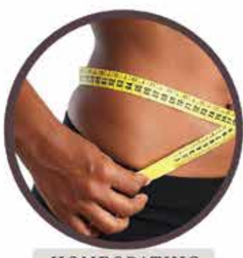
HOMEOPATHIC WEIGHT LOSS

Let Olive Seed enhance your health and well-being by decreasing inflammation, increasing immunity, and promoting overall well-being.